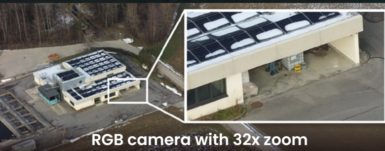
RGB camera with 32x zoom